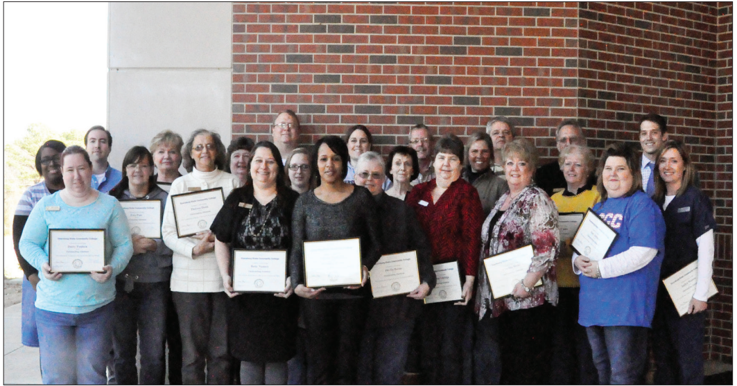
Dyersburg State faculty and Staff honored on January 16.