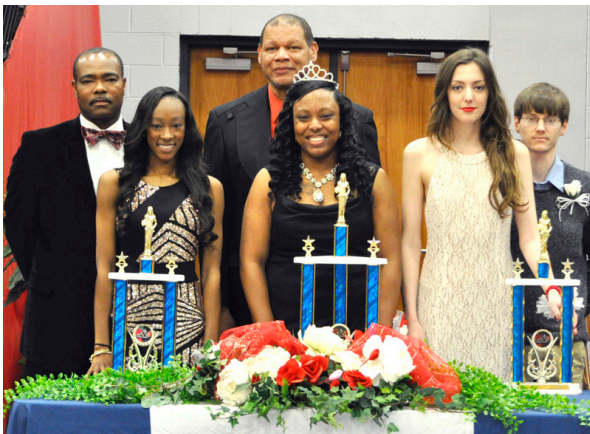
2016 Homecoming Court

The Dyersburg State Community College Eagles plan to soar against Chattanooga State Community College on February 24 as DSCC celebrates Homecoming 2017.